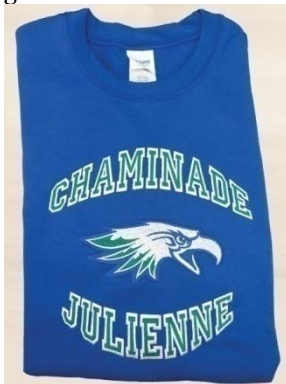
CJ Spirit Eagle Style Sweatshirt (hoodie or crew, CJ Green or CJ Blue)

On Monday through Thursday during the school year, students have the option to wear the following uniform-approved Outerwear Options on top of their uniform polo – and not in place of a polo. The CJ logo styles shown here are the only uniform-approved outerwear options and may not be customized or altered to include specific sports, clubs, or performing arts.