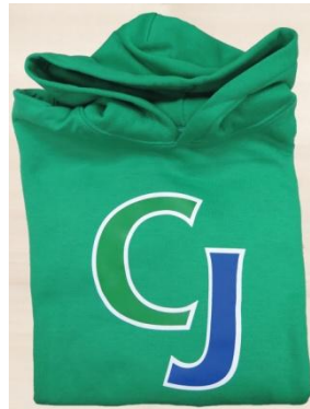
CJ Letters Style Sweatshirt (hoodie or crew, CJ Green or CJ Blue)