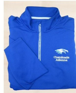
Quarter-Zip Pullover (CJ Blue only)